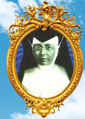
ICM Mother Foundress